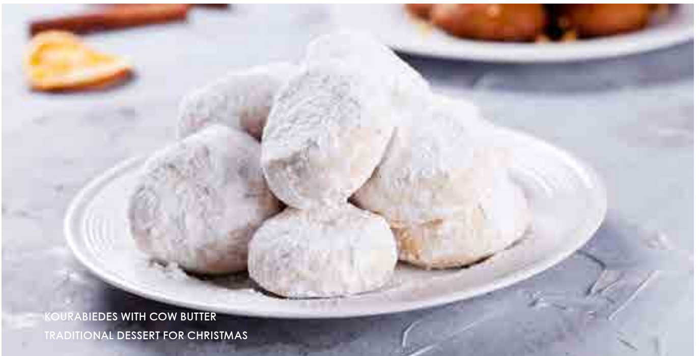
KOURABIEDES WITH COW BUTTER TRADITIONAL DESSERT FOR CHRISTMAS