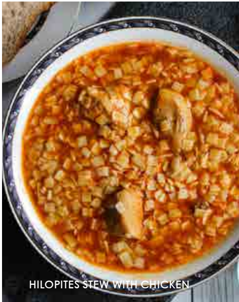
HILOPITES STEW WITH CHICKEN