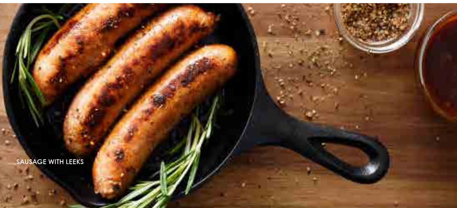
SAUSAGE WITH LEEKS

Pasto Sausage with orange from Kalamata has a unique form of making, as first it is smoked and then boiled with herbs and spices, providing a very different texture and taste.