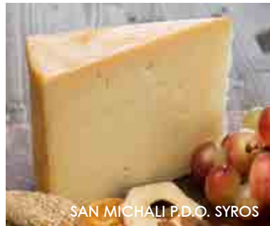
SAN MICHALI P.D.O. SYROS