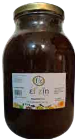
FIG MARMALADE 3,7kg in glass vase

TOMATO CHUTNEY WITH CHILI 670g in glass vase