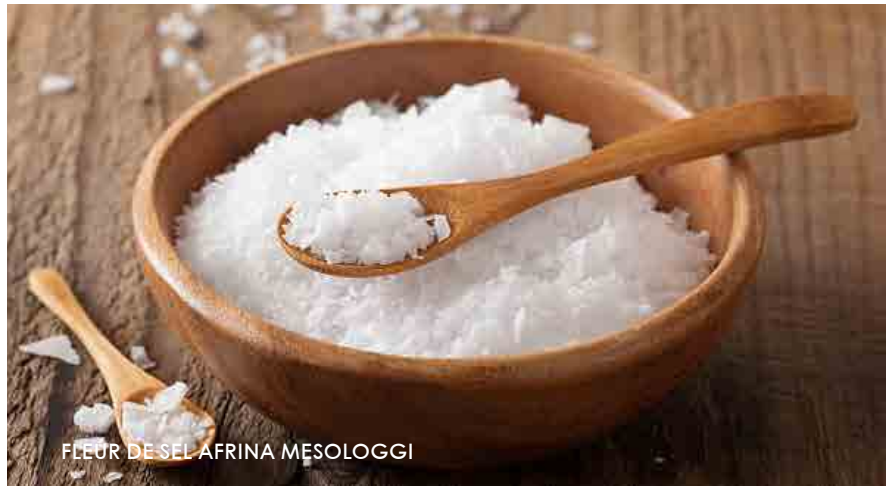
FLEUR DE SEL AFRINA MESOLOGGI