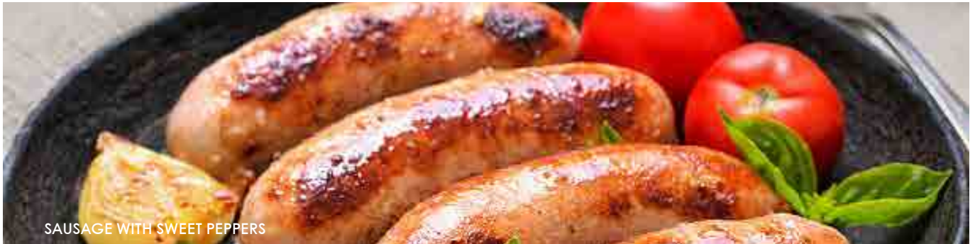
SAUSAGE WITH SWEET PEPPERS