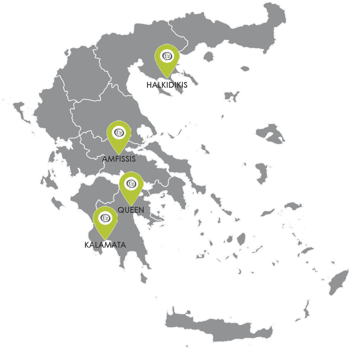
TABLE OLIVES VARIETIES