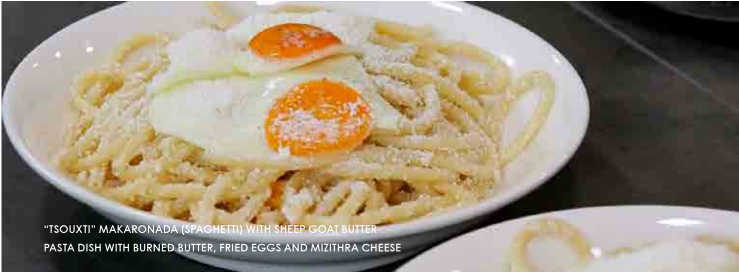
"TSOXTI" MAKARONADA (SPAGHETTI) WITH SHEEP GOAT BUTTER PASTA DISH WITH BURNED BUTTER, FRIED EGGS AND MIZITHRA CHEESE