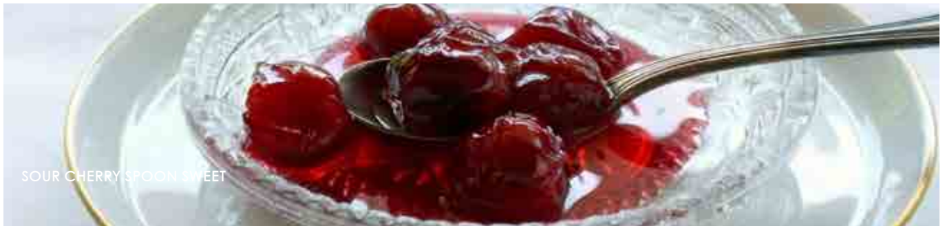
SOUR CHERRY SPOON SWEET