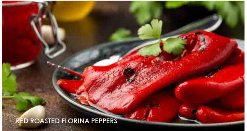
RED ROASTED FLORINA PEPPERS