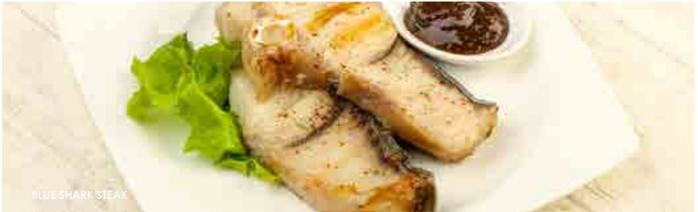
BLUE SHARK STEAK